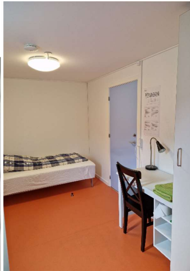
Room with 90cm bed