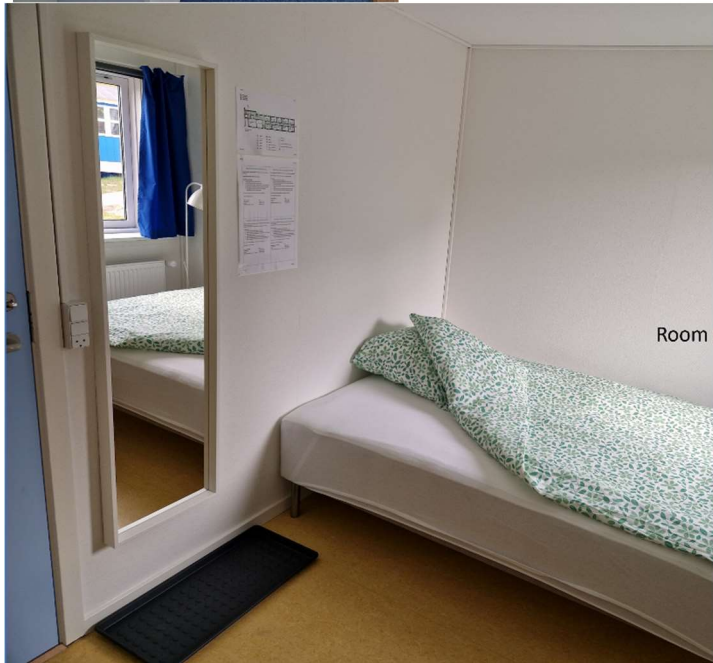
Room with 90cm bed